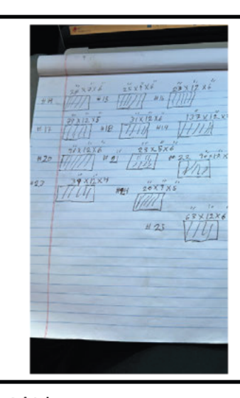
Media 5: Quantities