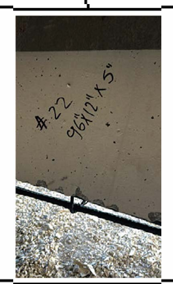
Media 51: P124