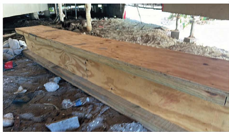
Media 45: shoring