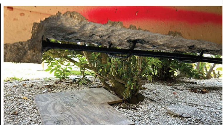
Media 47: P124